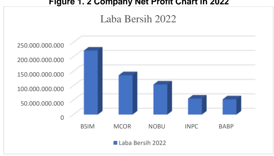
Figure 1. 2 Company Net Profit Chart in 2022

In investing their funds, shareholders have a goal, namely to get dividends and capital gains as well as income (return). Revenue (returns) is determined by the success of the company, as shown in published financial records (Ratnasari and Purnawati, 2019). Investors who reject significant risk will choose dividends over potential future capital gains and focus only on current dividends. Now dividends are more profitable than retained earnings because there is a possibility that the remaining profits will not be distributed as dividends in the future. Investors are usually looking for a stable dividend distribution in terms of dividend income. Because dividend stability will increase investor confidence in the company because it reduces investor uncertainty when investing funds (Yolanda and Juwita. 2022).