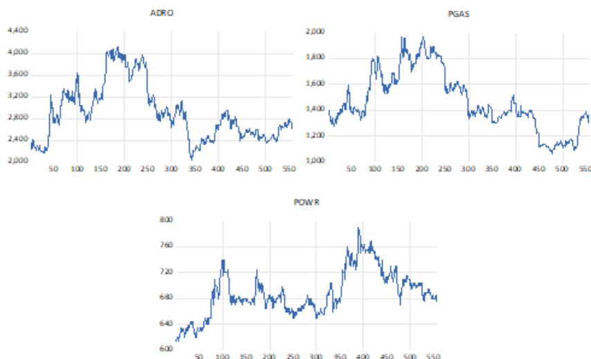
Figure 3. ADRO, PGAS and POWR Share Price Chart for the 2022-2024 Period Source: data processed using E-Views (2024)

These events caused a decline in coal prices and fluctuations in stock prices in the energy sector, such as coal, gas and electricity. High volatility in energy company share prices increases investment risk, fueling investor concerns about the sustainability of energy sector companies as long-term investments. Investors are starting to consider the risk of potential losses when investing in energy companies.